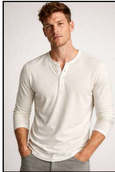
Full Sleeve T/shirt