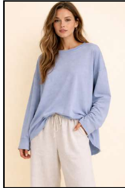
Full Sleeve T/shirt